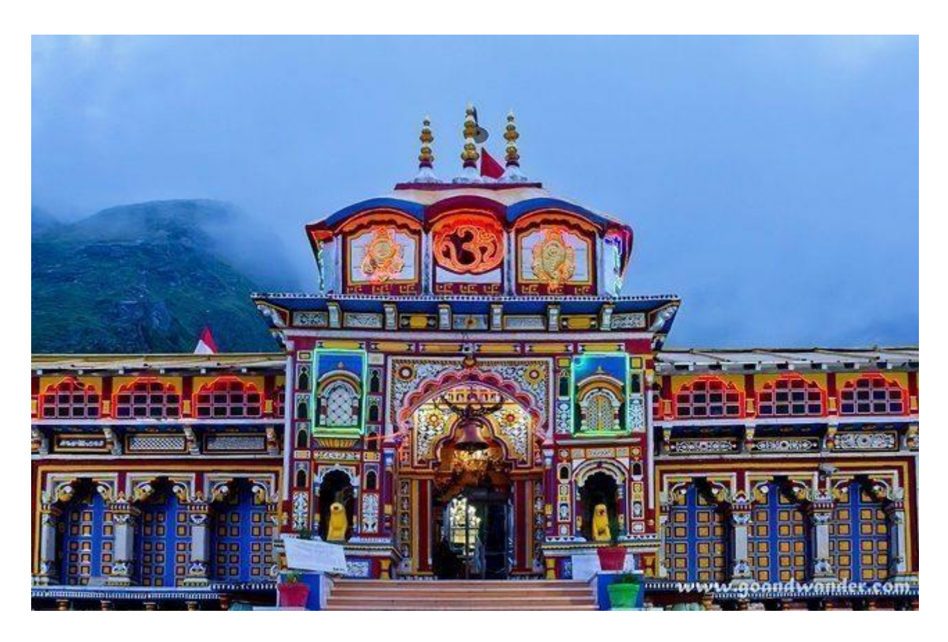
Day 2 (Kedarnath to Badrinath)